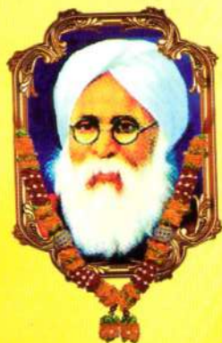
Mahatma Hansraj Who fulfilled his pledge of 25 years of honorary service as the first Principal of the first DAV College at Lahore