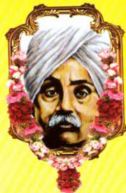
Lala Lajpat Rai The great martyr of the Indian Freedom movement and one of the founding fathers of The DAV Movement.