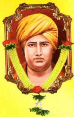
Swami Dayanand Saraswati The founder of the Arya Samaj and the great pathi-maker of modern India